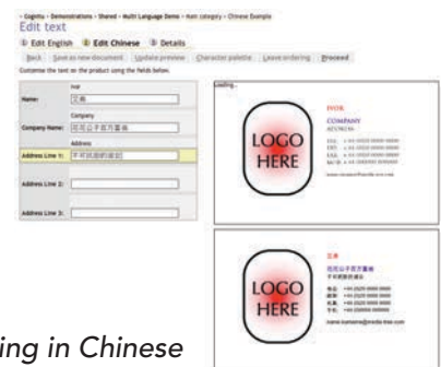
Editing in Chinese

For those that have complex deployments or cannot install Java due to their security policies, the system can generate preview images on the server side and feed updated images back to users as they tab between different input fields.