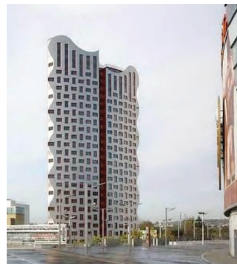
Visualisation of the Emirates Towers

Additionally Antony agreed to build 2,500 homes in the area and to make available new commercial units as many had to be bulldozed to house the new stadium. The building work is still going on in the area but where we are housed was the first major development besides the stadium and known as the Arsenal regeneration project. We are part of a complex of 550 flats and around 50 commercial units that are situated in a landscaped area with excellent transport links and with a view of the Emirates Stadium, for the many Arsenal fans who are attracted to live and work near their joy!