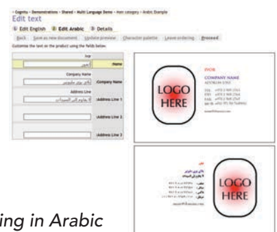
Editing in Arabic